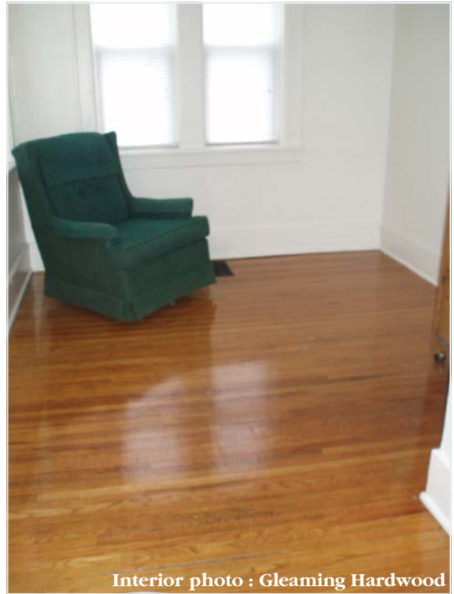
Interior photo : Gleaming Hardwood