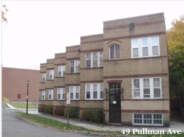
49 Pullman Ave